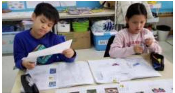
3I sorting different types of media